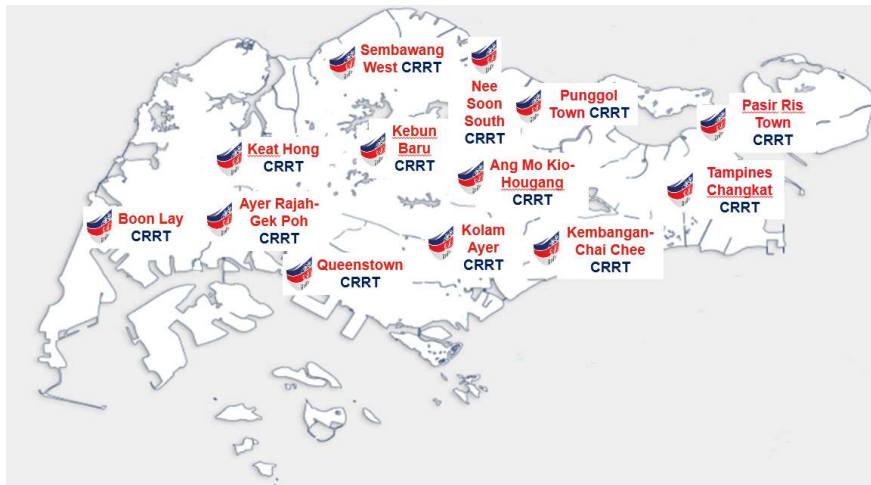
Map of CRRTs set up across Singapore

7. The Community Response Roundtable (CRRT) was also piloted in 2019, bringing representatives from schools, businesses, grassroots, religious, and other community groups within a geographical area to the same table. The CRRT seeks to strengthen cooperation across stakeholder groups to enhance local community-level emergency preparedness. There are currently thirteen CRRTs in 10 GRCs across Singapore, and there are plans to roll out more.