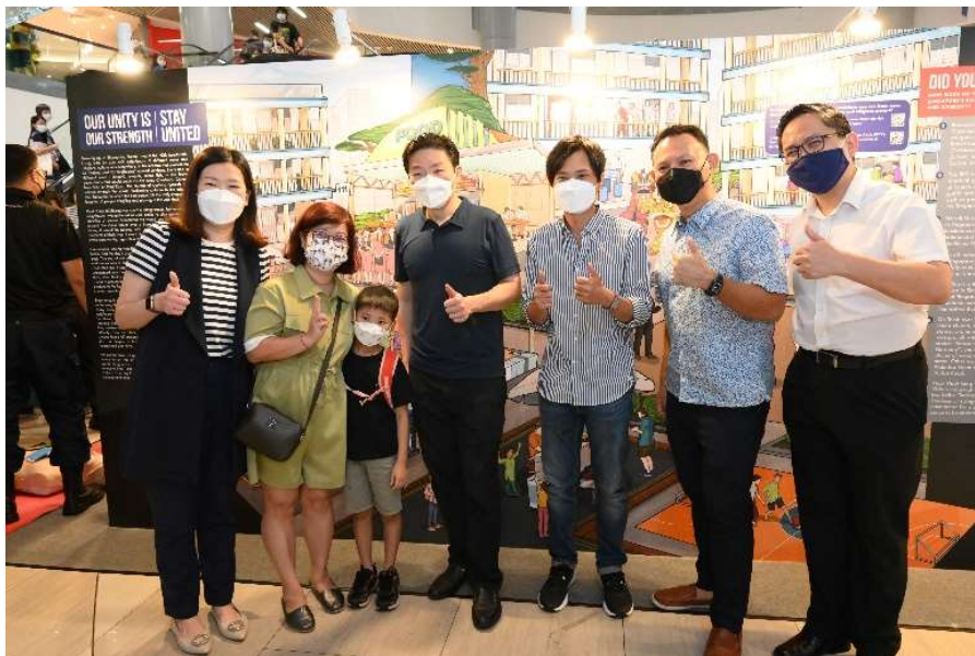
SGSecure Roadshow in July 2022