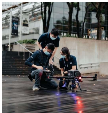
Aerial Response Team (ART)

2. In 2021, the Police operationalised its Aerial Response Team (ART) of trained and certified drone pilots, to integrate the use of Unmanned Aerial Vehicles (UAVs) into its operations. Drones have since been deployed to strengthen Police's operations in areas of enforcement, crowd management and public safety, search and rescue, as well as aerial patrols. More drone pilots will be trained in 2022 as part of the progressive build-up of the ART.